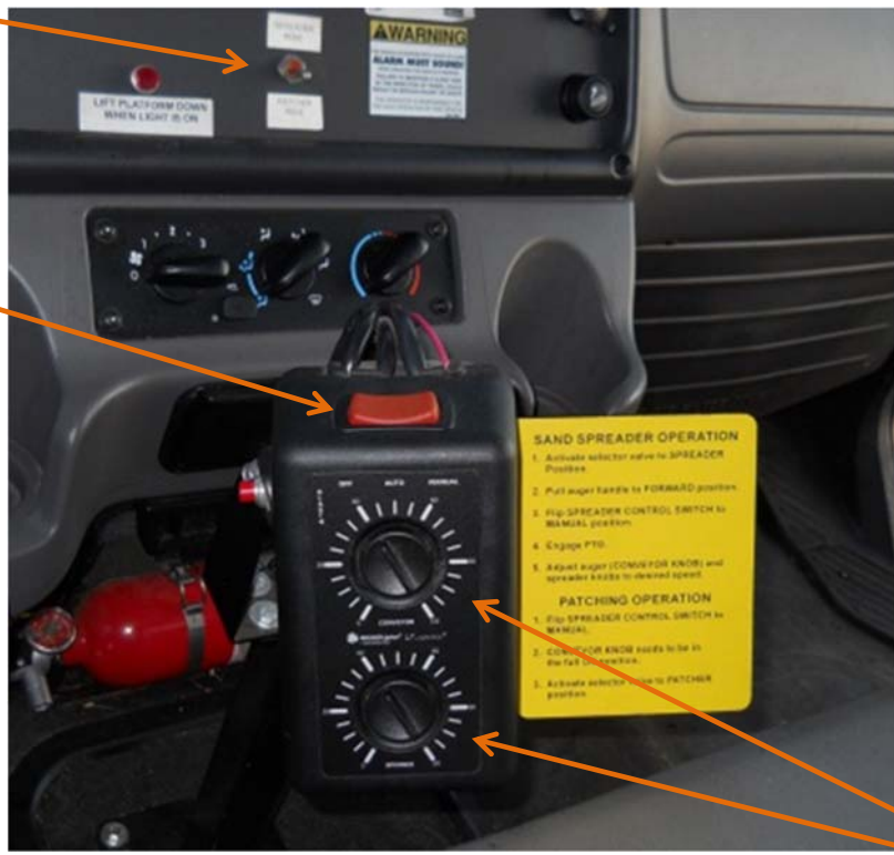
The speed of the spinner and discharge auger is controlled from inside the cab.